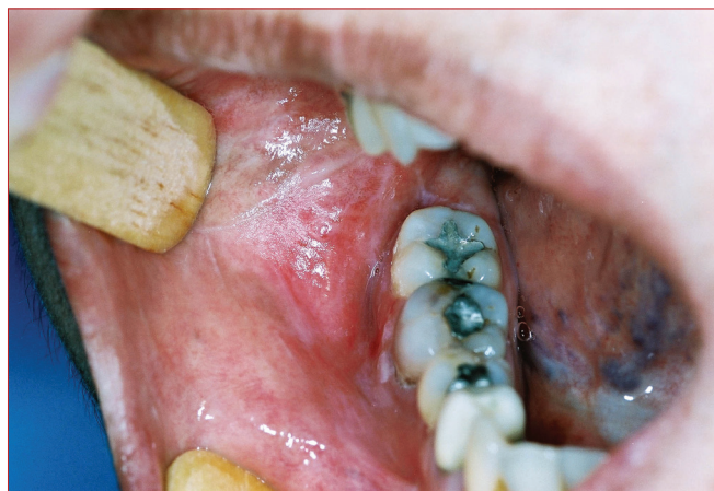
Figure 4. Right intraoral view after 6 months showing healed areas without recurrence of ulcers.

Thrombocytopenia may occur due to increased destruction, diminished production, or abnormal distribution of platelets in blood 5 . In the present case, HCV infection may have