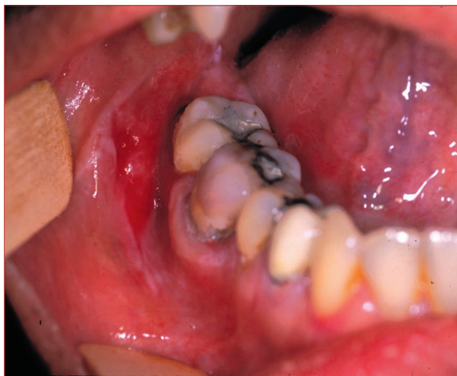
Figure 1. Right buccal mucosa showing an ulcer surrounded by white striae.

A 63-year-old woman complained of oral soreness associated with spontaneous bleeding during masticatory movements and tooth brushing. The symptoms had started 3 days previously. Bilateral irregular ulcers surrounded by white papules and striae with bleeding on minor trauma were observed on the buccal mucosa. On the right side, they extended asymmetrically to the pterygomandibular fold (Figure 1), and the lesions were smaller on the left side (Figure 2). The patient had occlusal amalgam restorations and posterior porcelain veneers in the mandibular teeth and a maxillary removable partial denture.