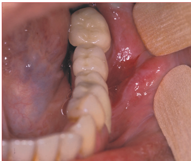
Figure 2. Left buccal mucosa showing an ulcer with spontaneous bleeding.

Chronic hepatitis C had been diagnosed 12 years earlier. The mode of transmission was unknown. Treatment with interferon and, later, ribavirin had been tried. Unfortunately, the side effects were so strong that the therapy had to be discontinued.